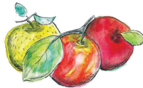
October – Apples