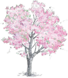
August – Cherries

Although we recommend following this calendar, your school or program can change the order of the calendar to suit your needs. None of the materials are printed with the month. The calendar will likely change each year to include new foods!