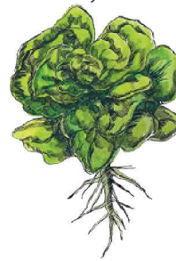
June – Leafy Greens