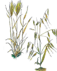
March – Grains