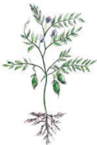
April – Chickpeas