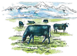
May – Beef