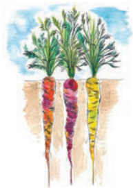
January – Carrots