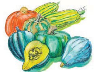
Nov. – Winter Squash