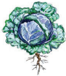
September – Brassicas