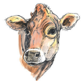
July - Dairy