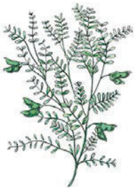
December – Lentils